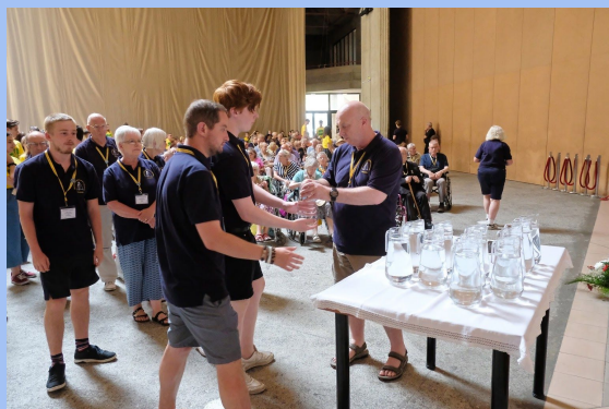
Helpers collected jugs filled with Lourdes Water

Our Lady's request to St. Bernadette in the 9th Apparition was actually to " Go, wash at the Spring ". So, during the Liturgy last year we filled jugs with Lourdes water from the taps, and everyone was invited to make a "gesture" with water, e.g. washing their hands or face.