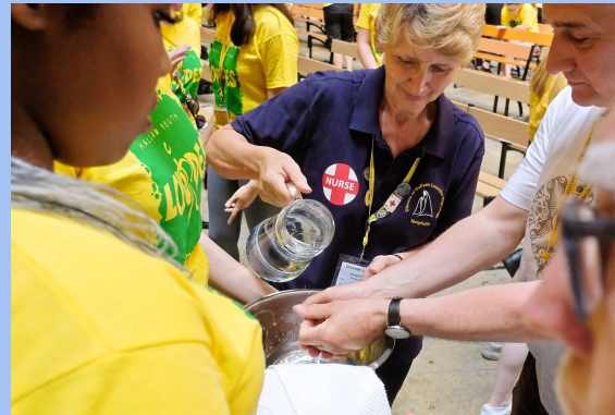
A pilgrim making a gesture with water, aided by a Helper & Youth

A Helper poured Lourdes water from the jug into a bowl, held by a Hallam Youth, and all 450 of us made some form of gesture within this Service. It was a very moving liturgy.